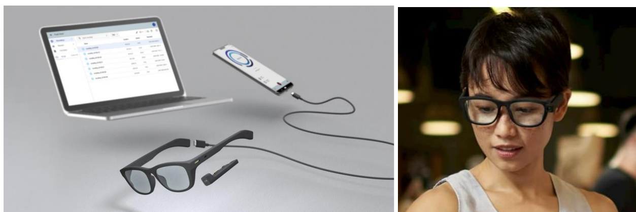
Image 2. Eye Movement Sensor Glasses

These glasses will be used to track where you look, they include a camera that records the direction of your gaze, and another camera that records the scene you are looking at. These glasses do not work when worn with another pair of glasses underneath. If you usually wear glasses to watch a performance, and have the option to wear contact lenses instead, please wear them for this experiment.